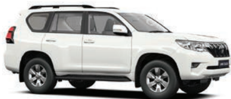
Pure White (040)