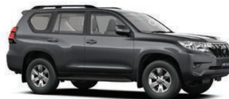
Ash Grey (1G3)