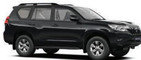
Astral Black (202)