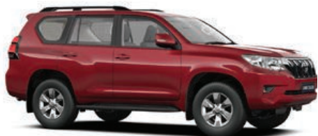
Barcelona Red (3R3)