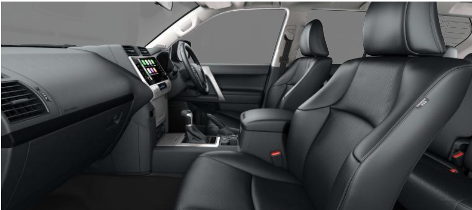
Black leather (LR22) *Business grade only