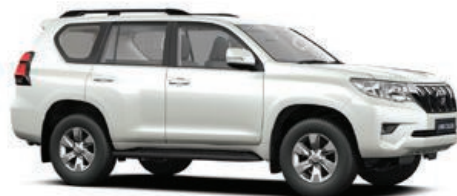
Pearl White (070) Pearlescent