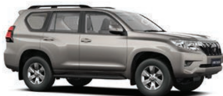
Avantgarde Bronze (4V8)*